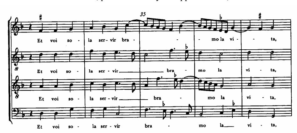
Ex. 2. "Madonna, per voi ardo" by Philippe Verdelot, mm. 33-37.

The Medici Court and the Development of Italian Madrigal: A Study of the Contributions of 43 Music Patronage in the 16th Century