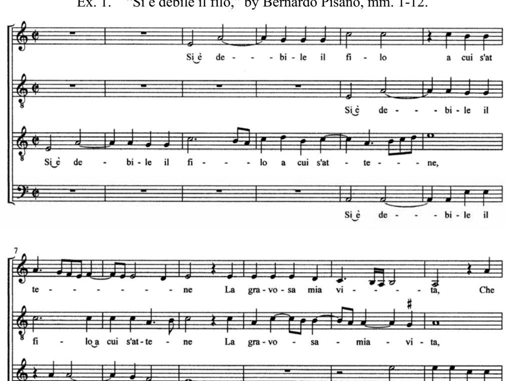
"Si è debile il filo," by Bernardo Pisano, mm. 1-12.

in the latter in which the bass part progresses in a melodic leap to serve as harmonic function (mm. 10-14), a typical feature of frottola. Perkins describes: "Source evidence suggests that this new manner of setting Italian texts, which is so clearly indebted stylistically to both the motet and the fully texted chanson of the period, continued to be cultivated primarily in Florence, at least through the 1520s."19