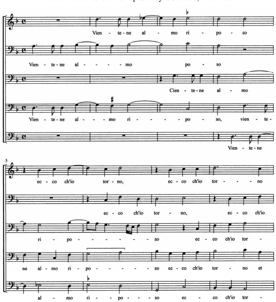
Ex. 4. "Vientene almo reposo" by Corteccia, mm. 1-8.

Instrumentation in the night scene is an early example of a long tradition in dramatic production-that representing darkness and Hell with sackbuts."<sup>30</sup> This madrigal is divided into two parts: the first part includes the first two lines of the texts (mm. 1-12), the second part enters after the fermata. The imitation between voices are treated very extensively at the first part. Each of the five voices is treated in imitation; altus and quintus are followed by cantus, then tenor and bass respectively. (Ex. 4)